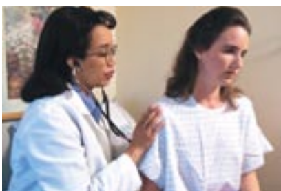
Doctor and patient

Scientists usually begin with an idea about what they want to investigate. This is also true for scientists who study people. This idea, or hypothesis, is the basis for their study. As you now know, a hypothesis (hi-PAH-thuh-sis) is an explanation based on observed facts or on an idea of how things work. For example, Dr. Goldberger hypothesized that there was a relationship between pellagra and diet.